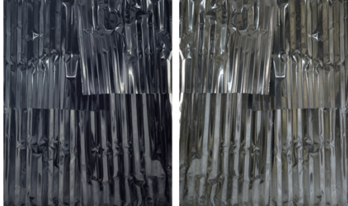
Luis Antonio Santos Untitled (Structures) 2023 Oil on canvas and galvanized iron sheet H152.4 x W243.8 cm (diptych)