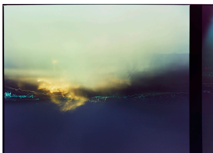
Lavender CHANG Don't walk in front of me, I may not follow #14 2021 Fine art archival print H72 x W100 cm / H100 x W139 cm