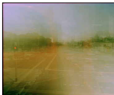
Lavender CHANG Wanderer #12 2019 Fine art archival print H81.45 x W100 cm / H100 x W122.7 cm

NB: More images can be furnished upon request.