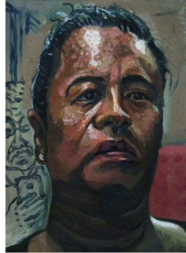
(L) Sebastian Mary TAY, Collapsing , 2022, Giclée print on Diasec mount, Edition of 7 + 1 AP + 1 EP, H50 x W50 cm (R) YEO Tze Yang, Study Of A Face On The Bus , 2022, Oil on canvas, H35.6 x W25.4 cm

Exhibition Period 26 November – 23 December 2022