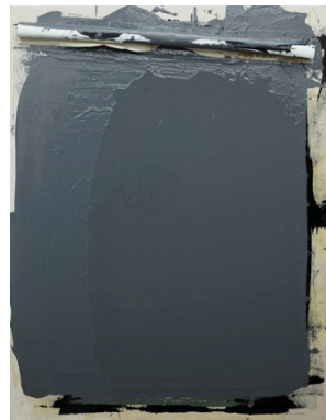
Clockwise, from top left Lavender CHANG, Don't Walk In Front Of Me, I May Not Follow #14 , 2021, Fine art archival print, H100 x W139 cm ONG Si Hui, Bend in the river series , 2018 - Ongoing, Granite, Dimensions variable Donna ONG, Four Colours Make a Forest , 2017, Screenprinted and laminated acrylic tiles, Edition of 3 + 1 Artist's Proof, H55.5 x W45.5 x D7.9 cm Bernardo PACQUING, Strata of Thought 01 , 2022, Mixed media on canvas, H152.4 x W120 x D8.5 cm

Note: Images are not to scale. High-resolution images are available upon request.