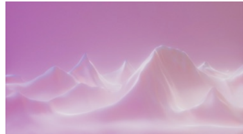
Sebastian Mary TAY Contemplating on Drifting Clouds (video still) 2021 Edition of 5 + 2 AP Single channel HD video, 00:03:33