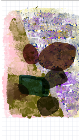
Ian WOO Snap #15 2021 Archival print on paper Edition of 10 + 2 AP H29.7 x W18.5 cm