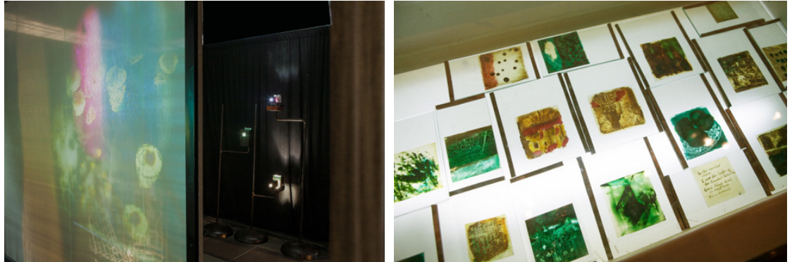
Installation view: L'Espace exhibition, Hanoi, April 2013.