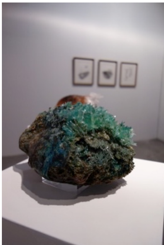
Sookoon Ang, Your Love Is Like A Chunk Of Gold series, 2011, bread, monoammonium phosphate, dimensions variable (installation views at Art Stage 2013)

High-resolution images are available upon request.