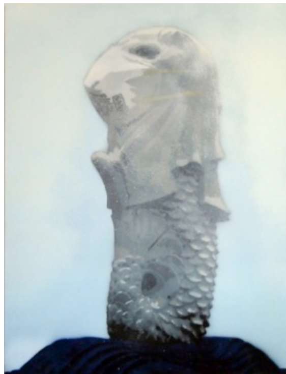
(L) ClogTwo, Graves are upside down , 2011, 2k gold paint and acrylic on canvas, 40 x 40" (R) TR853-1, MerlioN95 , 2013, Spray paint on canvas, 30 x 40"