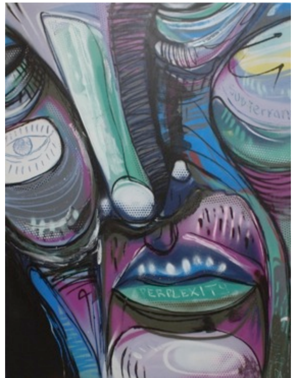
(L) ANTZ, Luo Lion , 2011, Mixed medium on canvas, 43 x 30" (R) ZERO, SubPerplexity , 2013, Aerosol paints on canvas, 48 x 36"

Note: Images are not to scale. High-resolution images are available upon request.