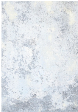
Artist NG Joon Kiat Title gateway series 4 Year 2018 Medium Graphite and acrylic on linen Dimensions H50 x W35 cm