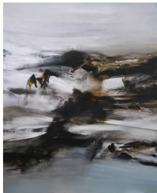
Artist Wyn-Lyn TAN Title Remnant Figments Year 2018 Medium Acrylic on canvas Dimensions H170 x W140 cm